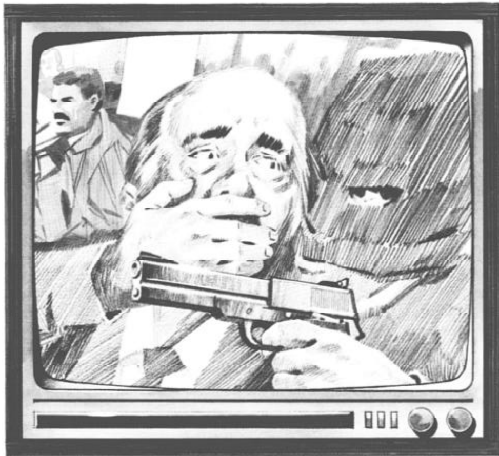
Illustrations by Ken Tuner

titude of causes, small and great, just and unjust. The prospects for success for many of these causes, however, are doubtful at best. Opposition or indifference to them is simply too overwhelming in many cases to permit the indi-